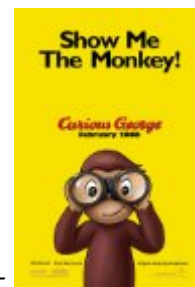
"Curious George" -