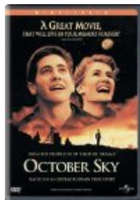
"October Sky" -

These are resources for discussing movies with your family and learning how to discern deeper values from popular entertainment.